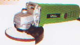
PG 10 N

Capacity : 100 mm Power Input : 850 W (With Toggle Switch) No-load Speed : 11,000 rpm Weight : 1.7 kg. (Approx.)